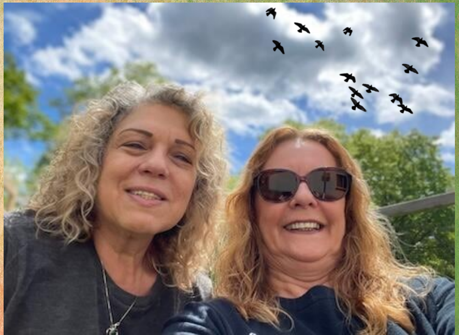
TWO OF OUR DEDICATED GREEN-THUMBED GARDENERS